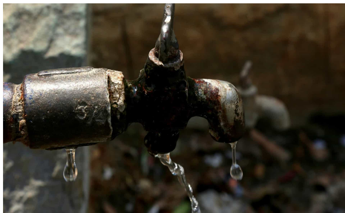
Figure 1: Example of waste of water