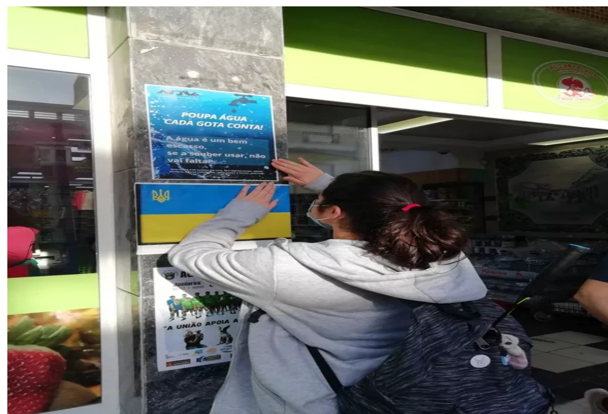
Figure 3: awareness-raising actions

An experimental activity was developed that consisted of the filtration of water through a coffee filter that, in turn, after filtration, kept certain sediments in it, thus initiating the water cleaning process, as happens in installations that perform this process, one of which the ETAR (Wastewater Treatment Plant). Awareness-raising activities were also carried out with interactive games and quizzes, whose target were children of the 1st cycle, more specifically 3rd and 4th year of schooling. These activities warned of the risks of waste, but also of the correct forms of consumption. Finally, pamphlets were distributed by the children and teachers of the 1st cycle with a message of awareness of the theme and posters were distributed in the village of S. Brás de Alportel.