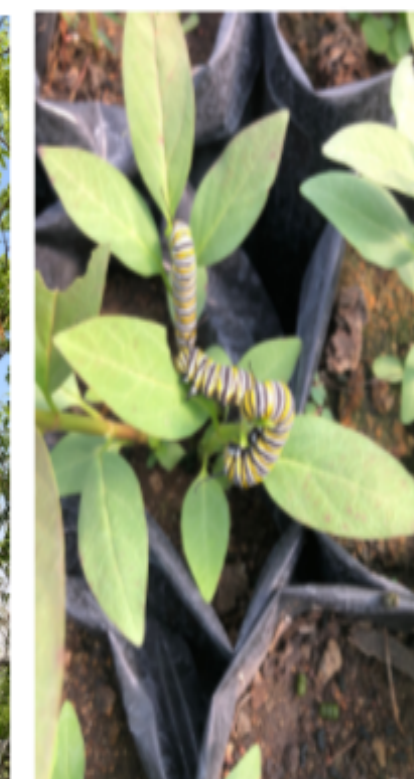
Asclepias (Monarch butterfly caterpillar flora)