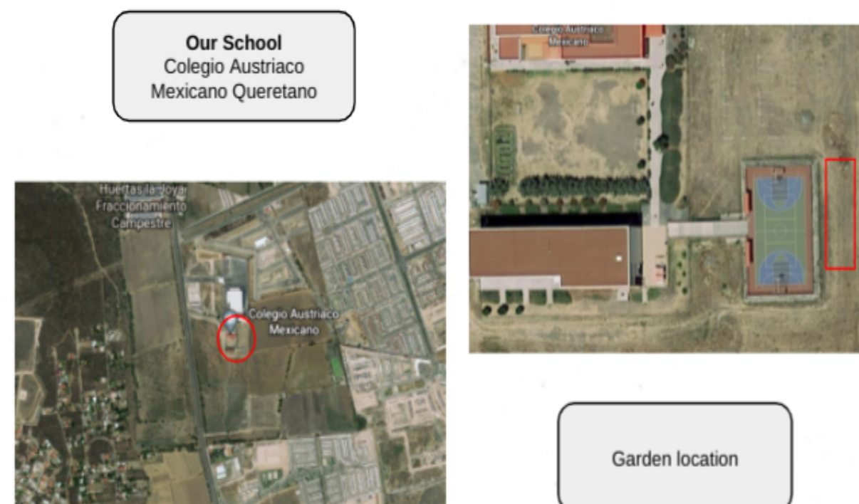
Figure 3: We made a garden blueprint in collaboration with the school management to see where we can carry out our idea of planting endemic

Scientists we talked to shared some suggestions to make a difference. As a first option in our private as well as our scholarly environment, we can improve traffic problems with carpooling. Secondly, planting native trees as well as small bushes on our school grounds to regulate the temperature of our school area. Fortunately, there is an organization in Querétaro (FIRCO) that comes into agreements with schools and donates native plants that are used for reforestation and restoration of green areas.