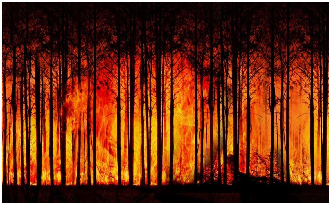
Figure 1: Forest fire in Andalusia

After the first sixth generation fire declared in natural space of Sierra Bermeja in Málaga, the objective of our investigation will be to compile the environmental data of the last few years, matching with our daily activities and proposing a combination of solutions beginning of the local field, and involving all the social groups, in order to confront one of the biggest problems we have right now, Climate Change and its consequences.