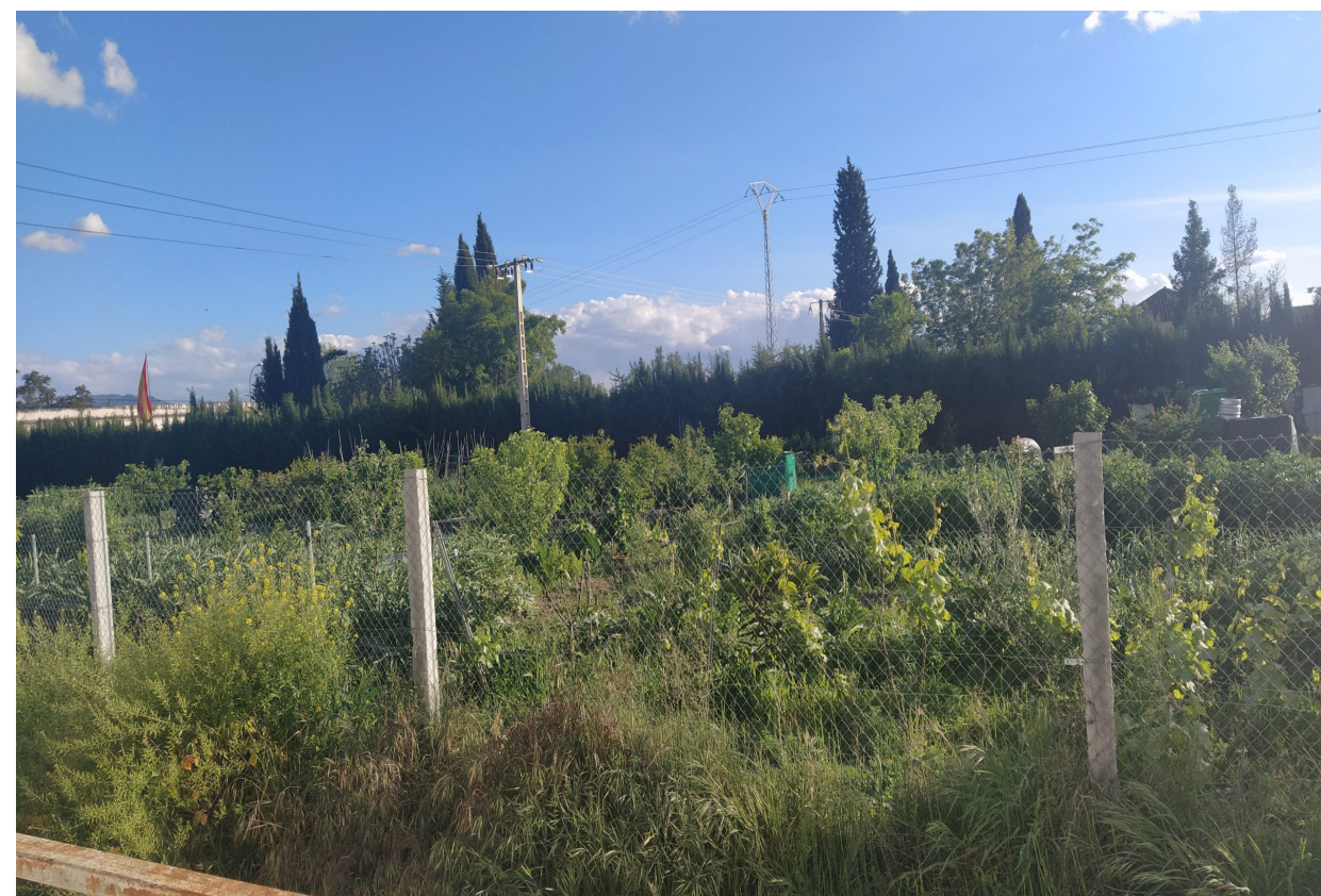
Figure 3: Propuesta de cultivos heterogéneos ecológicos para minimizar los problemas de contaminación de suelo y acuíferos