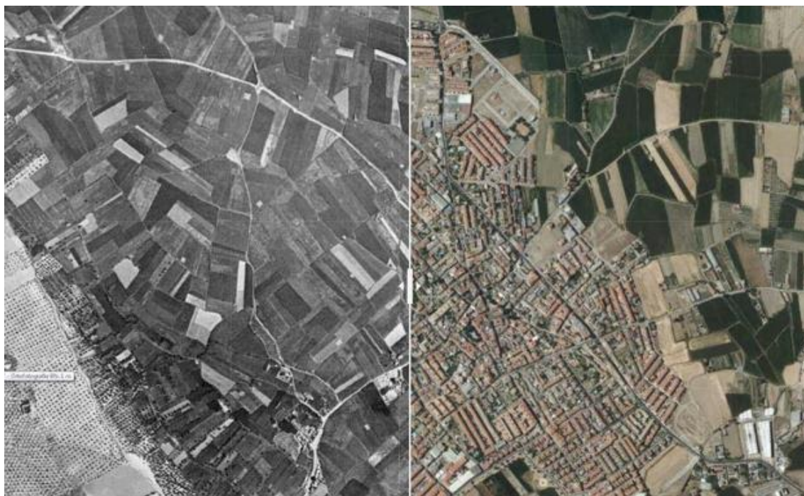
Figure 1: Reducción de la superficie agrícola de la Vega en las últimas décadas

On the other hand, pollution has increased due to the growth of car parks, population,