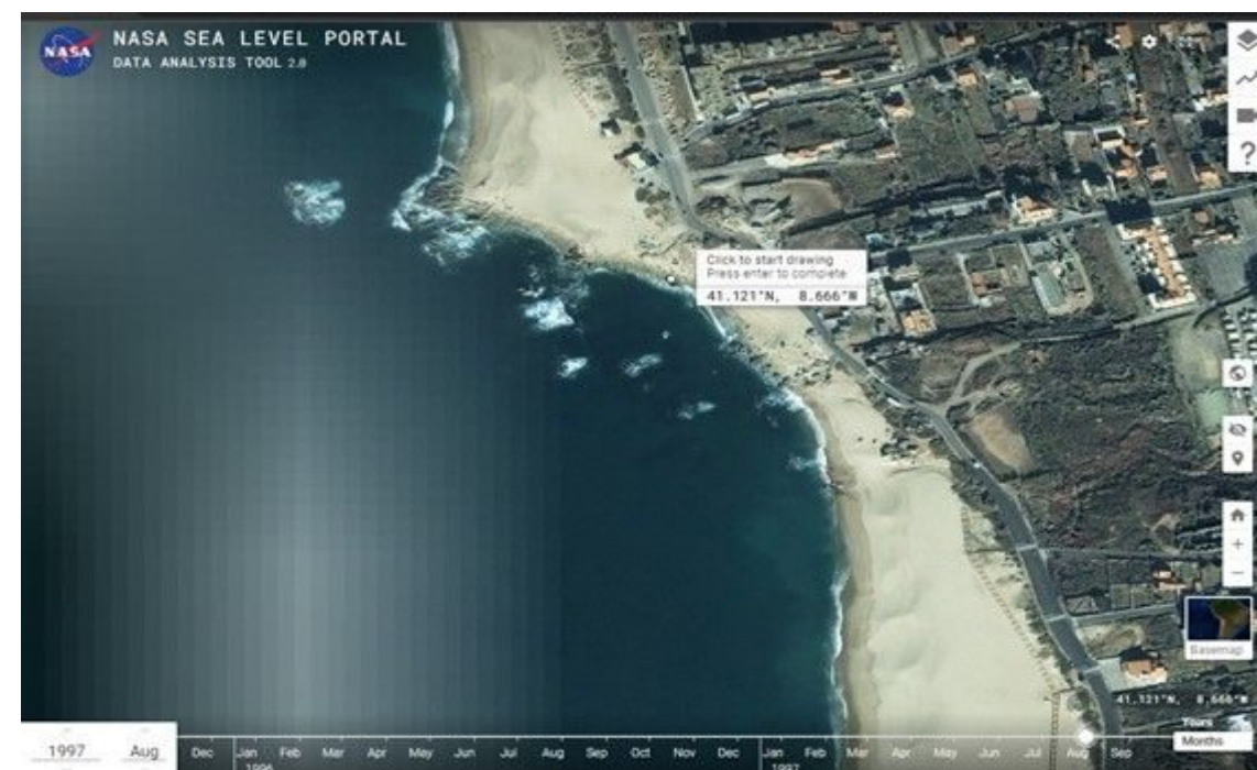
Figure 1: Figure 1 - Location of the region around Salgueiros beach.

The small city of Canidelo is situated in a coastal area, e several houses and infrastructures are placed there too. We want to predict how far would the sea level rise and how it will affect people's daily lives. We are conscious that the sea level is rising due to the melting glaciers. This melting is related to the Earth's mean temperature increase caused by the increase of greenhouse effect All of this is a consequence of pollution.