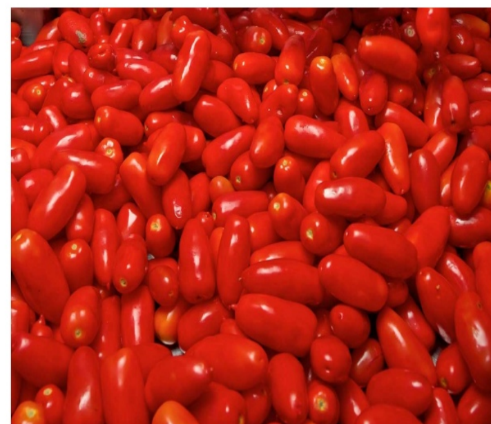
Figure 3: Red Gold

From Temperature and rainfalls variatios which there have been in last years, we can deduce that human is destroyng an essential heritage for our comfort, because tomato and the San Marzano tomato, with its organoleptic properties, can help us to keep our body healthy.