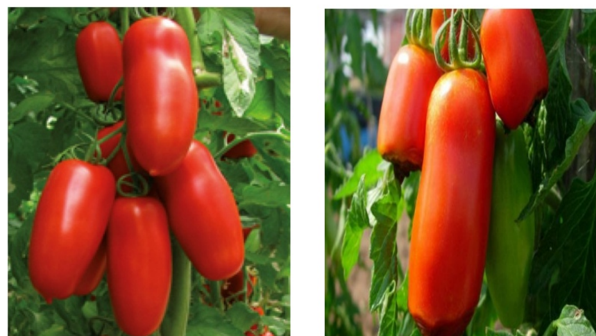
Figure 1: San Marzano tomato end with physiopathy BER

Our investigation wants to understand if the abiotic factors which characterize this physiopathy, have been limited in years and if we can think about a returne to the full agricultural production of our product, or if these characteristics will remain and will cause still damages to the production.