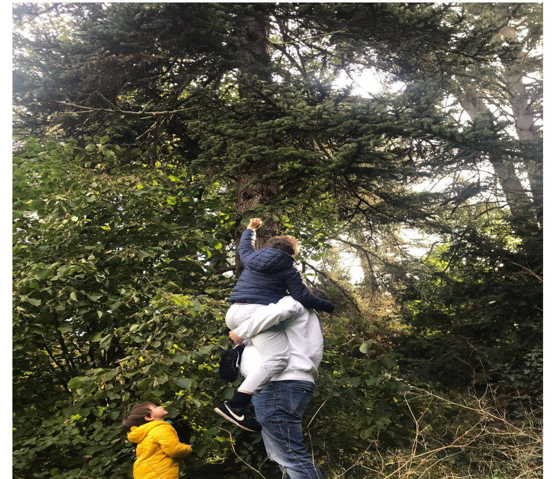
Figure 2: Trees near my house to build a herbarium