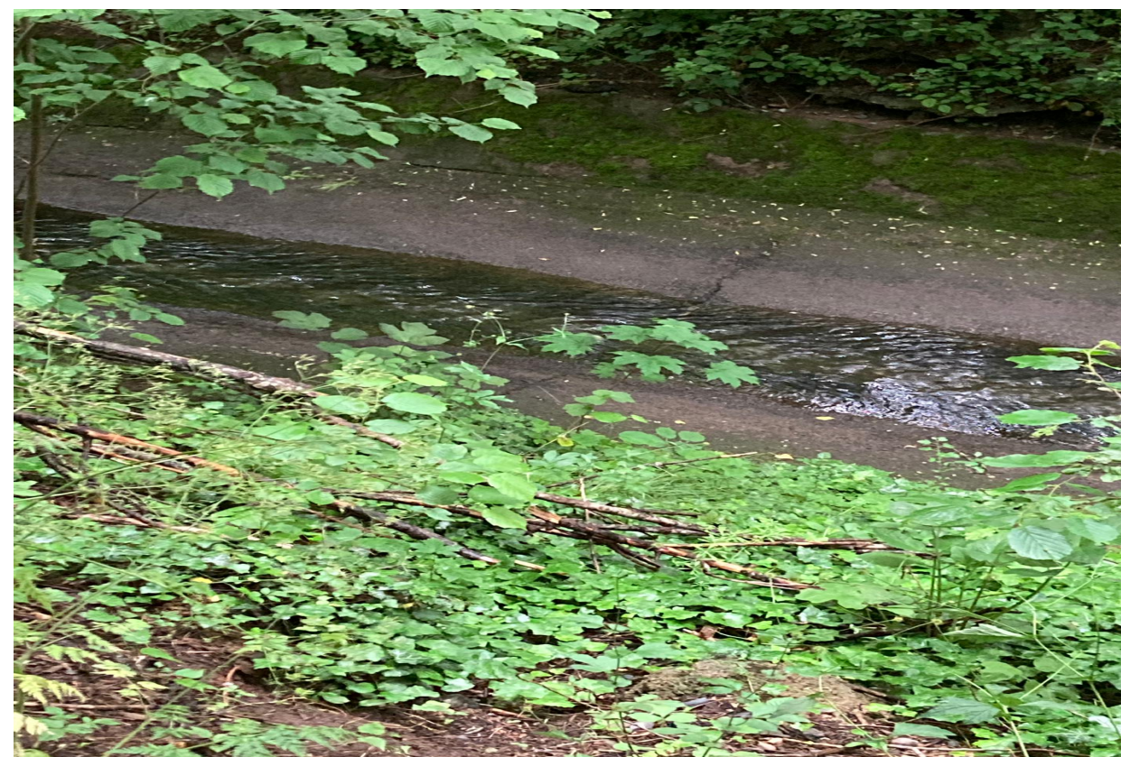
Figure 3: Site Survey

The fight against microplastics is everyone's business. Their proliferation is due to our frenetic consumption of plastic. Fortunately, it is possible to reduce it by changing our daily habits.