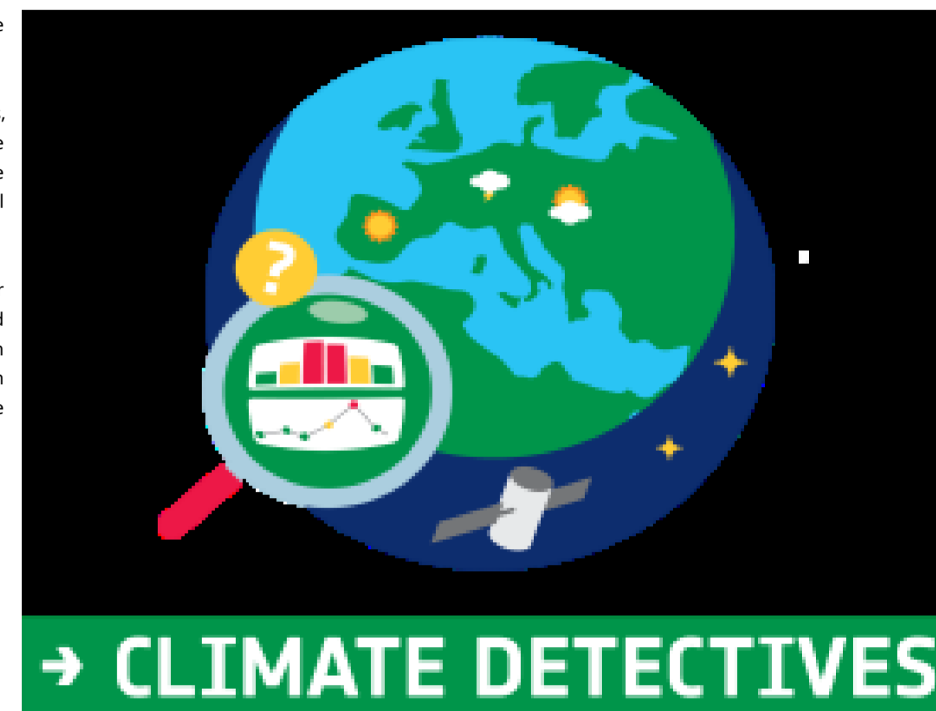
Figure 2: Climate Detectives 2021

The measurement of temperatures in each neighborhood and the observation of how each region is warmer or less ventilated, may bring data to be inserted in an annotation worksheet. Through photos, filming and daily temperature checks, we will be able to devise a way to improve the local environment. Since each team member lives in a distant neighborhood, the temperature may be milder in one neighborhood and higher in another. It will be interesting to see what are the reasons for these differences, the relief, the climate and the vegetation. Everything is important, everything is a given