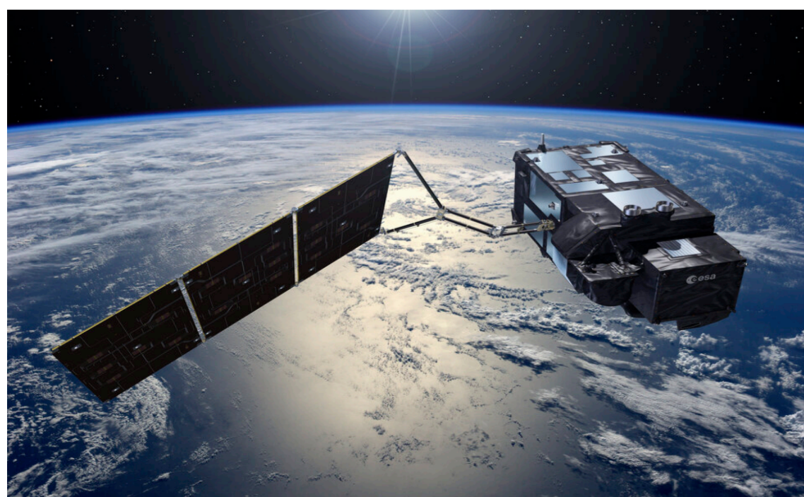
Figure 1: https://apps.sentinel-hub.com/eo-browser/