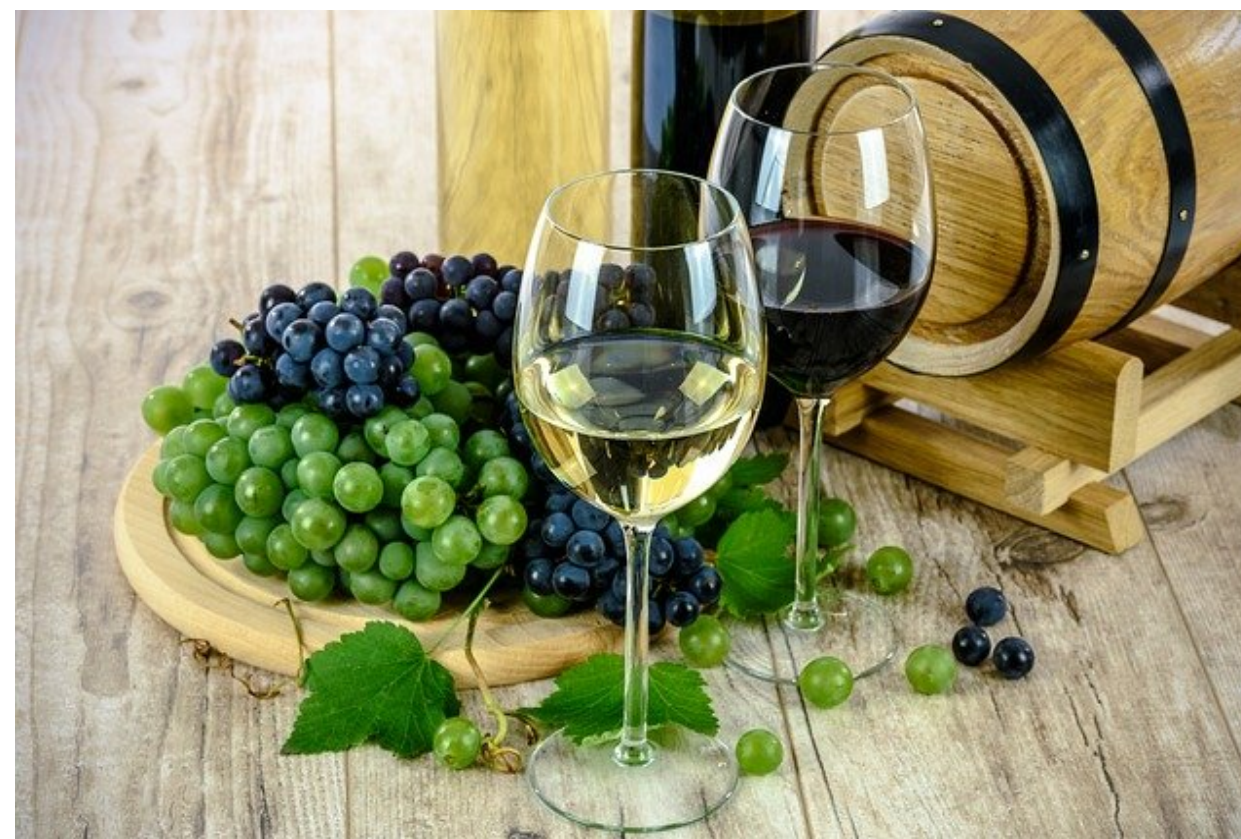
Figure 3: Wine is very important in Toro

We must make people aware that climate change is affecting us