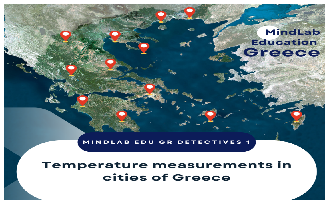
Figure 1: Cities where measurements and official data taken

Firstly we understood the difference between climate and weather and discussed climate change with the help of data and satellite imagery. Secondly we programmed the microcomputer microbit to record the temperature and performed a series of measurements to check its accuracy. Then we programmed microbit to record temperature every hour and placed it outside our home protected and away from heat sources so that we do not have errors in our measurements. After a week of measurements we collected our data and processed it to calculate the minimum, maximum and mean temperature values. Knowing now how scientists work, the data they need to collect and that our own measurements would not help us understand climate change, we took our project one step further. We collected the official mean temperature measurements for periods longer than 40 years and compared them with the average temperature of the last three years for a number of cities.