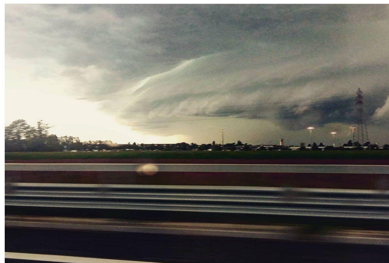
Figure 3: Supercell in Brescia: 12th August 2019

In order to reduce the negative consequences of this situation, we could all try to do many things in our daily life, starting from the easiest aspects of life, like the waste sorting, a sustainable consumption of electricity, resources, renewable sources of energy, preferring car-sharing or public transports instead of our cars.