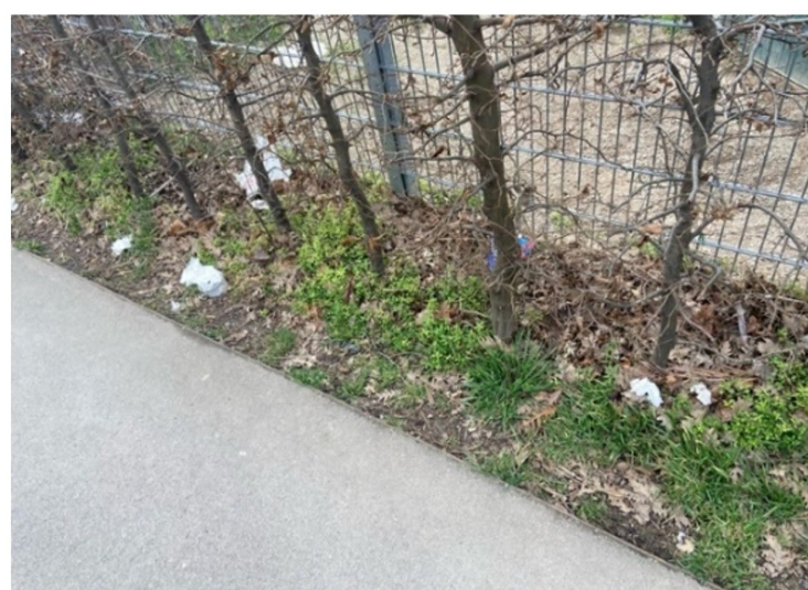
Figure 1: Trash in the Motorikpark

Our group of seven had assigned three members for each of the investigated places: Wig, Motorikpark and Laaerberg Street .Additionally one group interviewed people in the WIG. We used 30 L bags to collect the trash . Together we created an spredssheet with a diagram for each location.