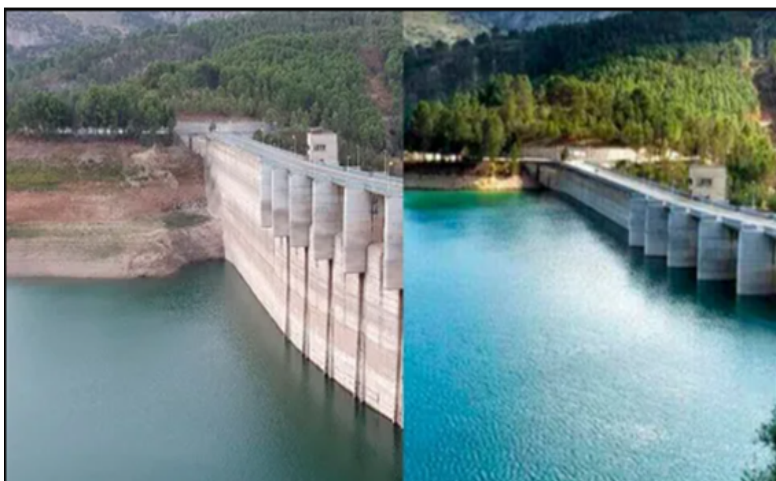
Figure 1: Iznájar reservoir at two different times

Using satellite images (ESA, Google Earth) the surface of the dammed water will be determined over the longest time period that we can establish. Temperature and precipitation data will be collected (State Meteorological Agency) and reservoir water level and consumption (Guadalquivir Hydrographic Confederation). The newspaper library and the historical archives of the region will also be visited and testimonies will be collected from the elders of the place. The data will be treated statistically in order to draw conclusions that can answer the starting question.