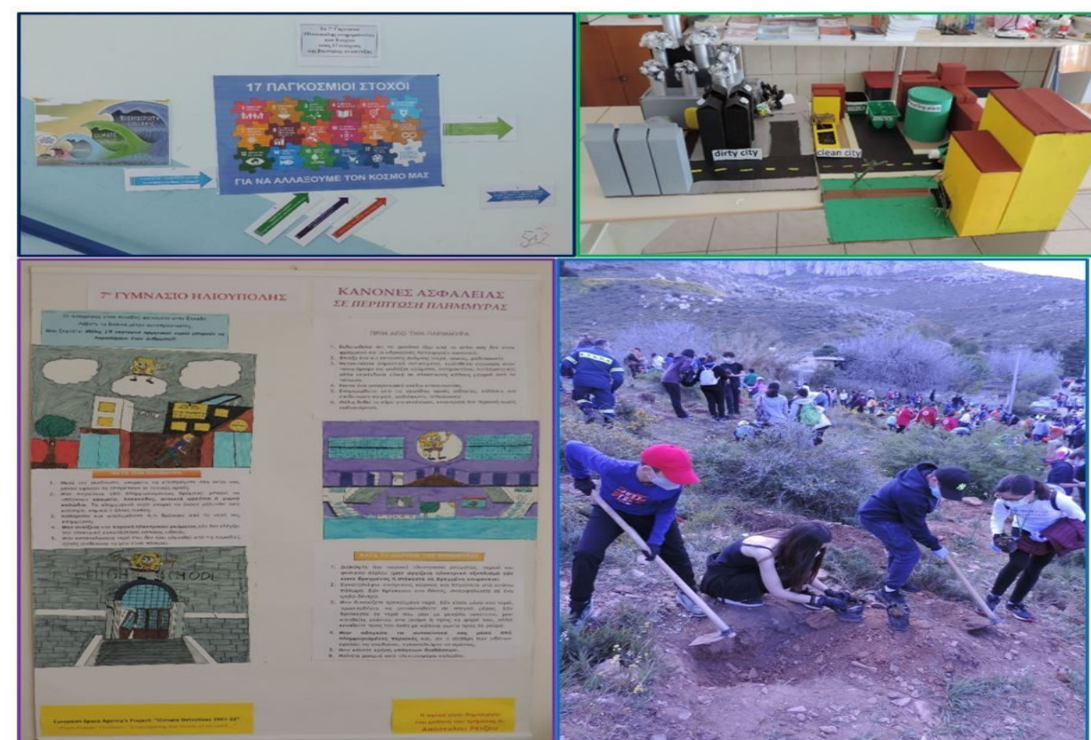
Figure 3: Posters of sustainable development and flood instructions- Trash art- Reforestation