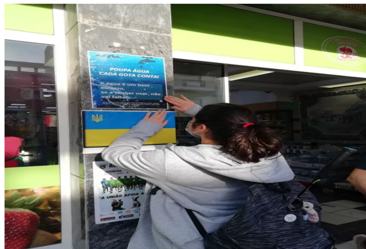
Figure 3: awareness-raising actions

An experimental activity was developed that consisted of the filtration of water through a coffee filter that, in turn, after filtration, kept certain sediments in it, thus initiating the water cleaning process, as happens in installations that perform this process, one of which the ETAR (Wastewater Treatment Plant). Awareness-raising activities were also carried out with interactive games and quizzes, whose target were children of the 1st cycle, more specifically 3rd and 4th year of schooling. These activities warned of the risks of waste, but also of the correct forms of consumption. Finally, pamphlets were distributed by the children and teachers of the 1st cycle with a message of awareness of the theme and posters were distributed in the village of S. Brás de Alportel.