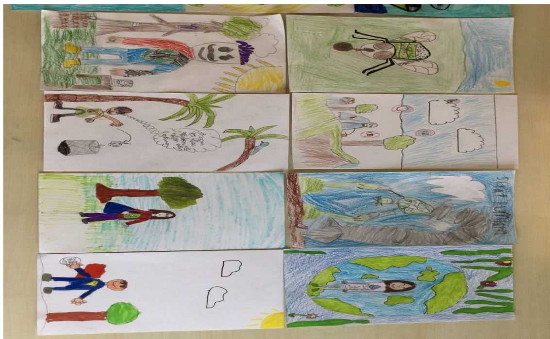
Figure 1: They draw climateheroes.

When it comes to paper collection, we have weighed how much we threw away at about 3 week intervals. The students have come up with the proposal to have an extra box with scrap paper that you can use to write / count when you do not need to save what you have made "scrap paper". This has meant that we have almost saved 1 kg of paper during the period we have been actively talking about this.