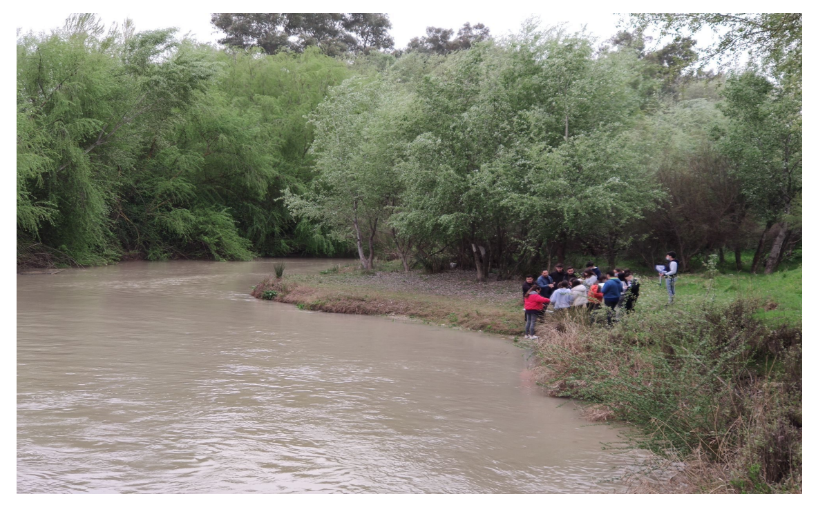
Figure 1: Investigation process

The Guadalquivir river as it passes through our town, Andújar, has suffered a very pronounced deterioration in recent times. Its riparian forest is highly degraded and heavily polluted with multiple waste and discharges. The quality and quantity of water is poor. All this causes the town of Andújar to live with its back to a river that was historically integrated into the town.