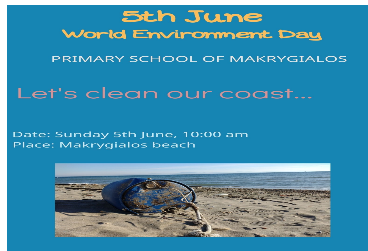
Figure 3: "Let's clean our beach!" poster for world environment day

First of all we plan to organise an action of cleaning local coast at the world environmental day on 5th of June. After that at the end of school year we will inform local community and social partners on an open event taking place at our school about our project and our results and conclusions reached. Children will play a role of multipliers to their families of what they learned through our project.