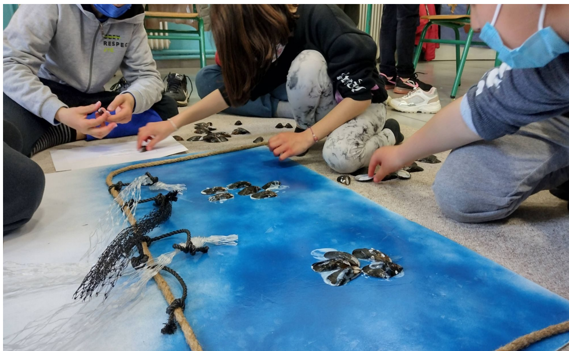
Figure 1: Working together on a "mussel farm"

First of all, we defined what marine ecosystem is and what we consider as healthy ecosystem. Then we talked about mussels, how they are raised, what are the appropriate conditions and places for mussel farms and what is their role in the food chain. With the Local Mussel Farmers Cooperative we visited the port of the area where they showed us the means and the process of collecting mussels. After that we visited a local place where processing mussels, peel (open) and pack to be delivered to consumers. We discussed about satellites and their importance and through satellite images we located the mussel farms in our area. We connected and combined satellite images with observations on the field by visiting a neighbouring observatory where we observed with binoculars the extent of mussel farming that we saw on satellite images. Together with the Municipality we are planning to take action by organizing an action of cleaning the local coast and inform local community at the World Environment Day. Implementing mathematics and the scientific method as well we created and shared a questionnaire to local community so as students to see the way scientists work and to detect opinions and have a research on mussel farming. On the art field we created a simulation of a mussel farm by using everyday materials and things that mussel farmers use (nets, barrels, mussel shells etc).