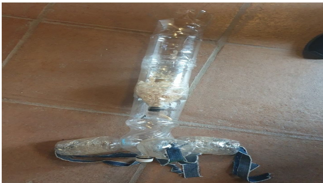
Figure 1: Latest TriPETRICall model used to help ground a wildfire

The next phase will be to test and characterize the types of soils that remain after a fire like the one in Sierra Bermeja.